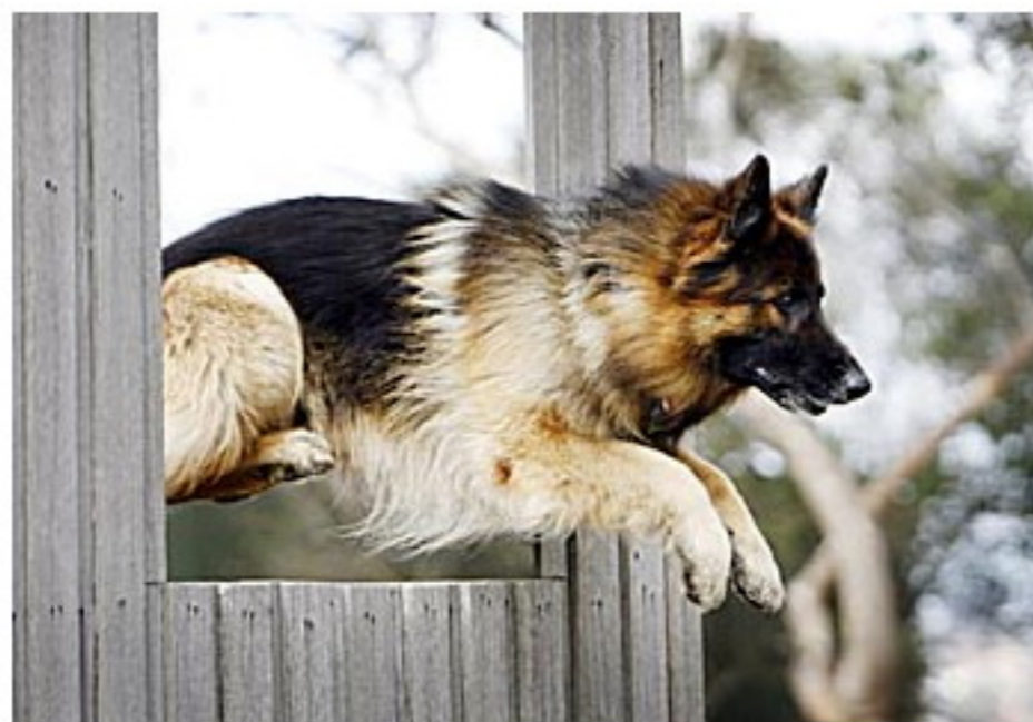
Police dog Salem.