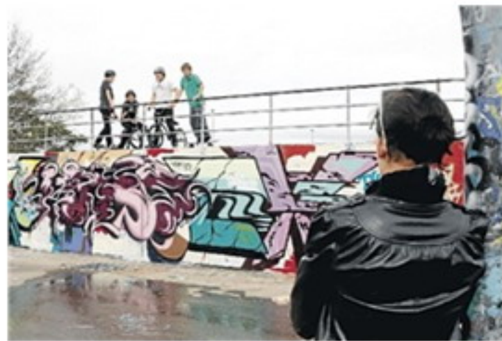
A 19-year-old woman, who spent time with a graffiti gang, has revealed why people tag.

Many vandals started their criminal careers with tagging, getting their spray paint from older vandals.