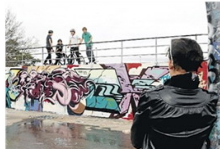
A 19-year-old woman, who spent time with a graffiti gang, has revealed why people tag.